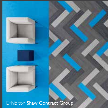
Exhibitor: Shaw Contract Group